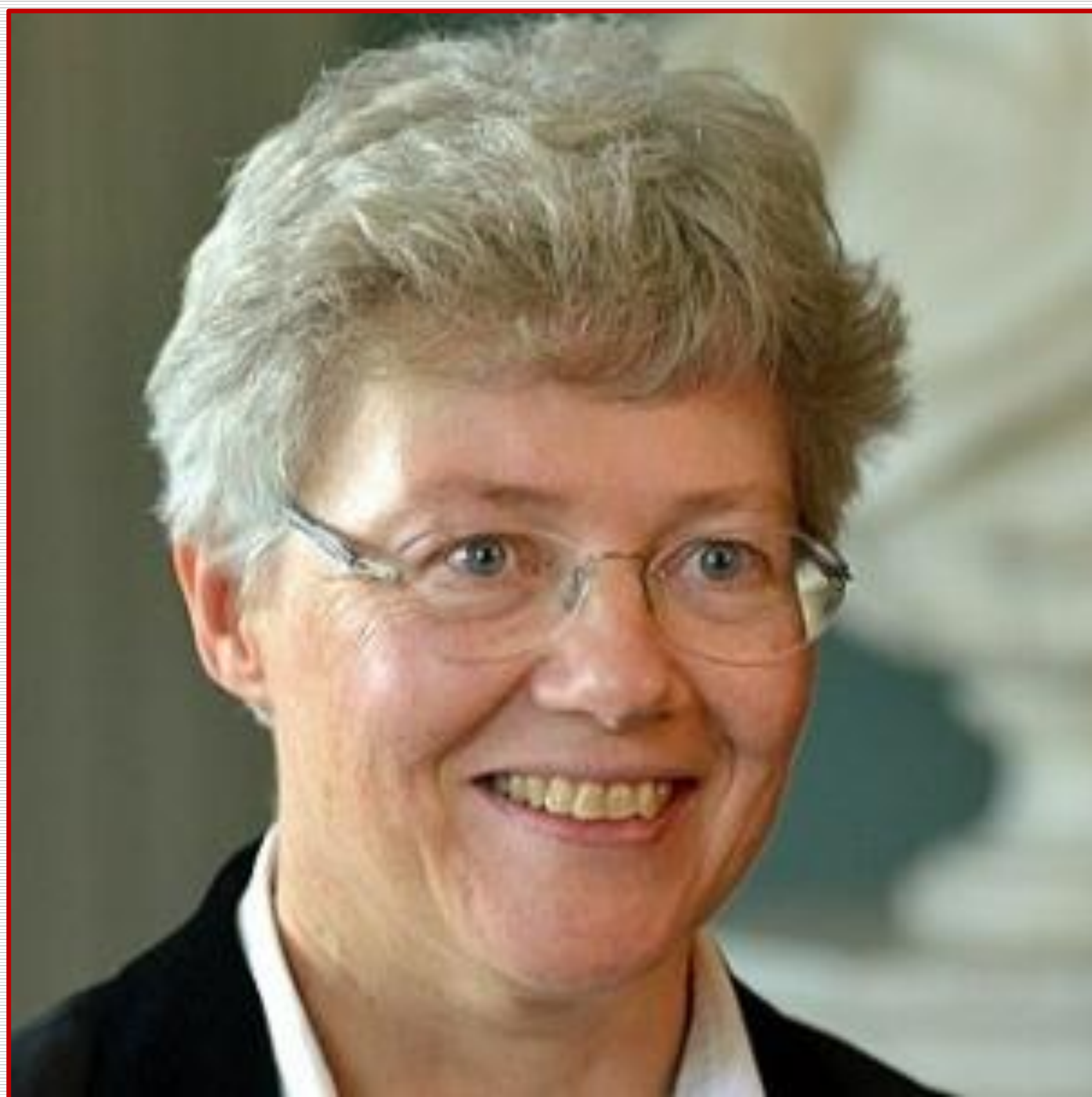
Prof. Anne L'Huillier Physics Nobel Laureate Lund University, Sweden